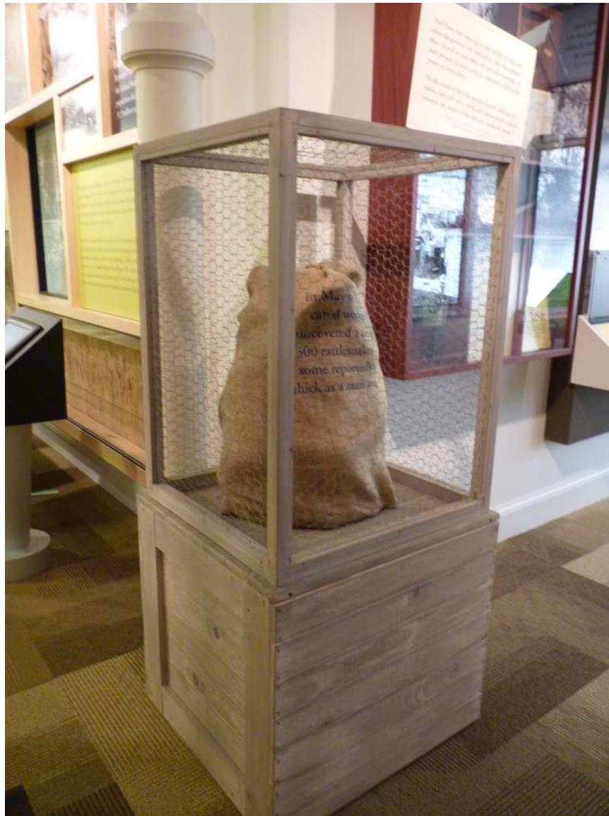
Canal Workers Discover 300 Rattlesnakes