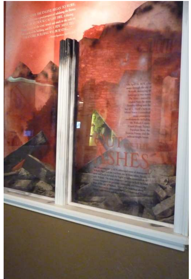
A Fire Destroys Downtown Wabash